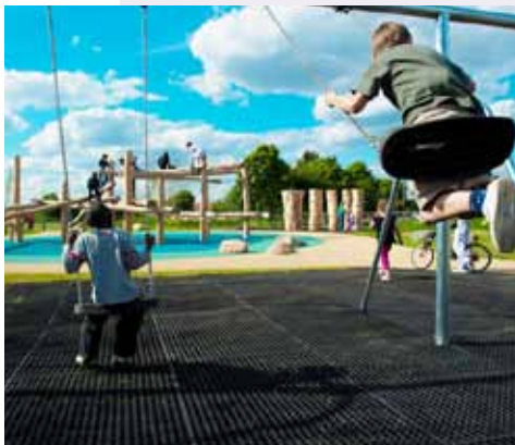
Chester Road play area