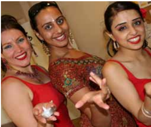
Com Café Fun Day