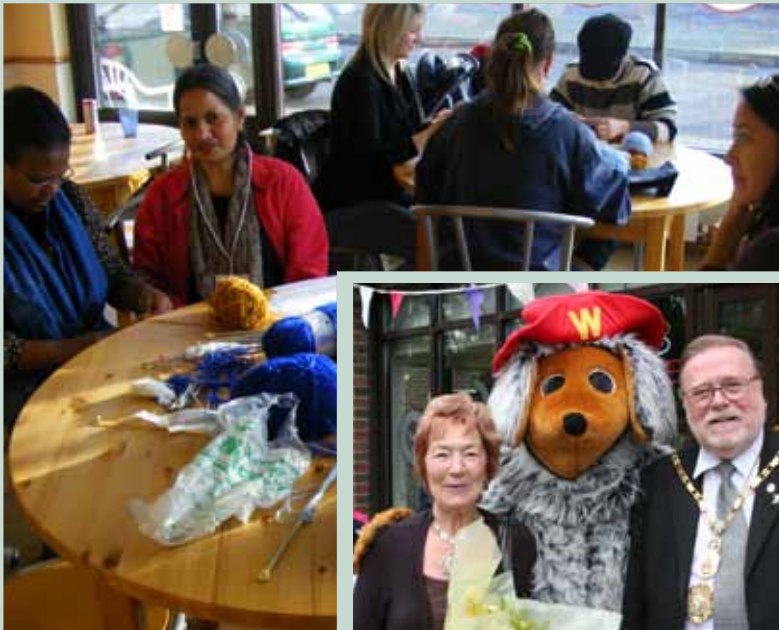
Knit and Natter at the Com Café

The Com Café has created an environment which is building a sense of community and where people want to spend time. Working with partners, the Com Café has helped two people get paid employment in the past 12 months. It has given new experiences and opportunities to over 30 families, and raised awareness of health and wellbeing.